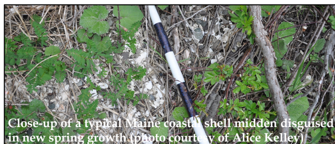
Close-up of a typical Maine coastal shell midden disguised in new spring growth

Volunteers will work to create a research database of observations and photographs and in severe circumstances may recover endangered cultural material. All monitoring is performed in accordance with land owner or land organization wishes, and Midden Minder volunteers must file a notarized letter from the landowner indicating permission to be on the property and clarifying the disposition of eroded cultural material. For questions related to this process or any other aspect of the program please be in touch, were happy to answer questions! middenminders@maine.edu .